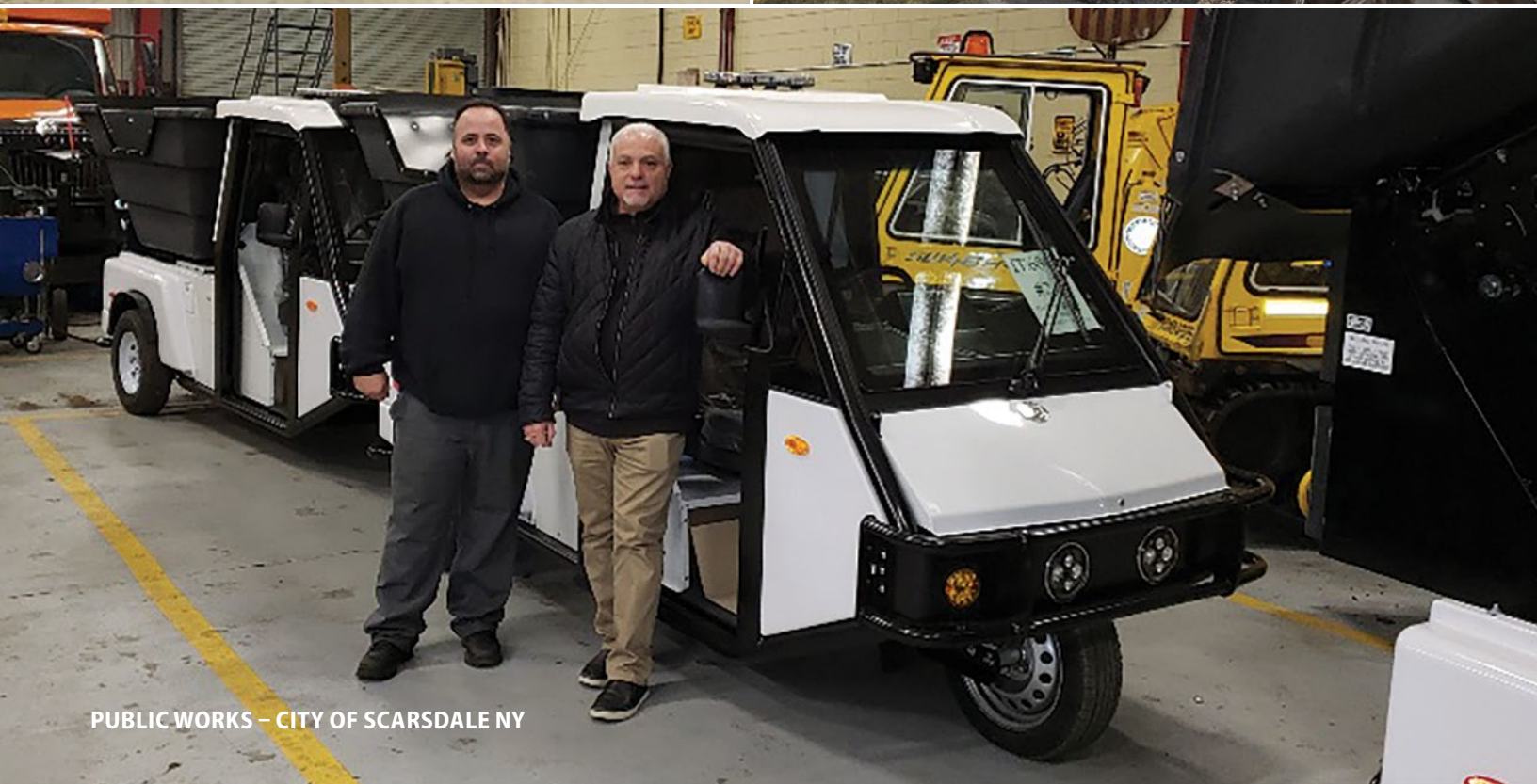
PUBLIC WORKS – CITY OF SCARSDALE NY