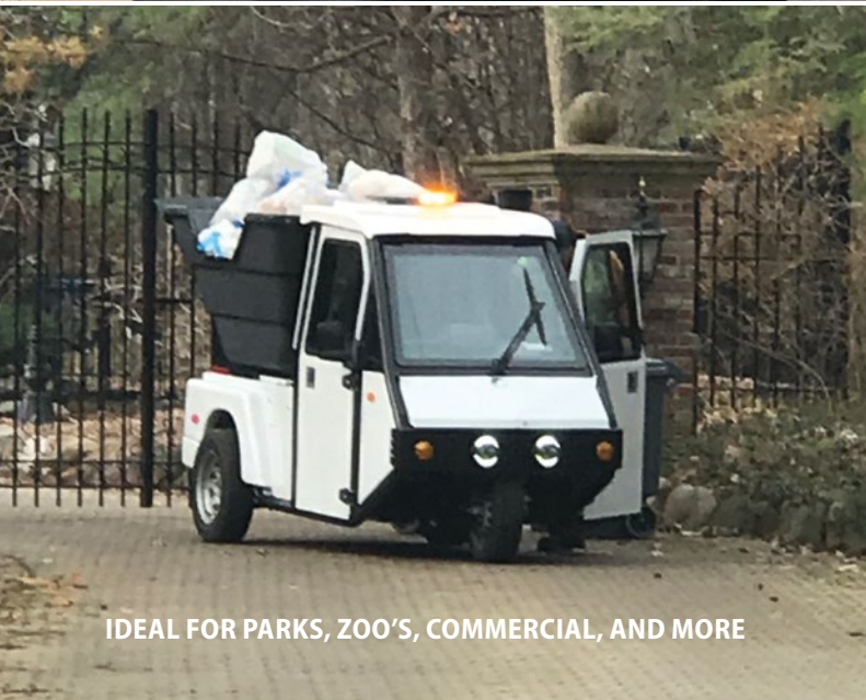
IDEAL FOR PARKS, ZOO'S, COMMERCIAL, AND MORE