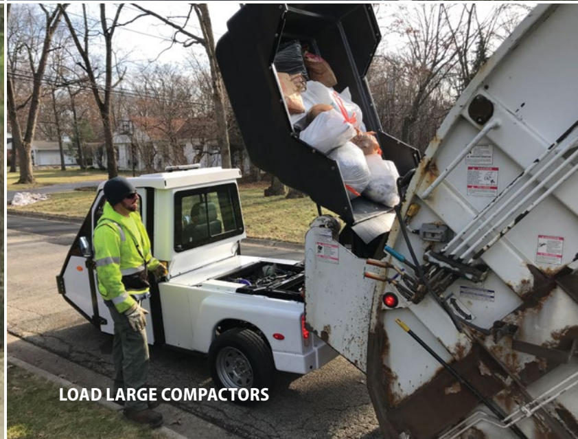
LOAD LARGE COMPACTORS